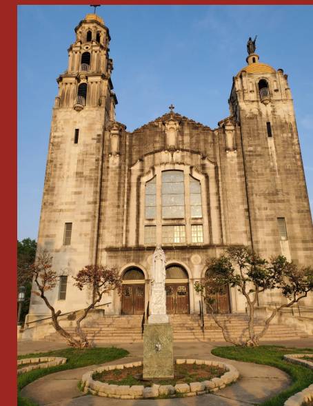
The Basilica of the National Shrine of the Little Flower, San Antonio TX