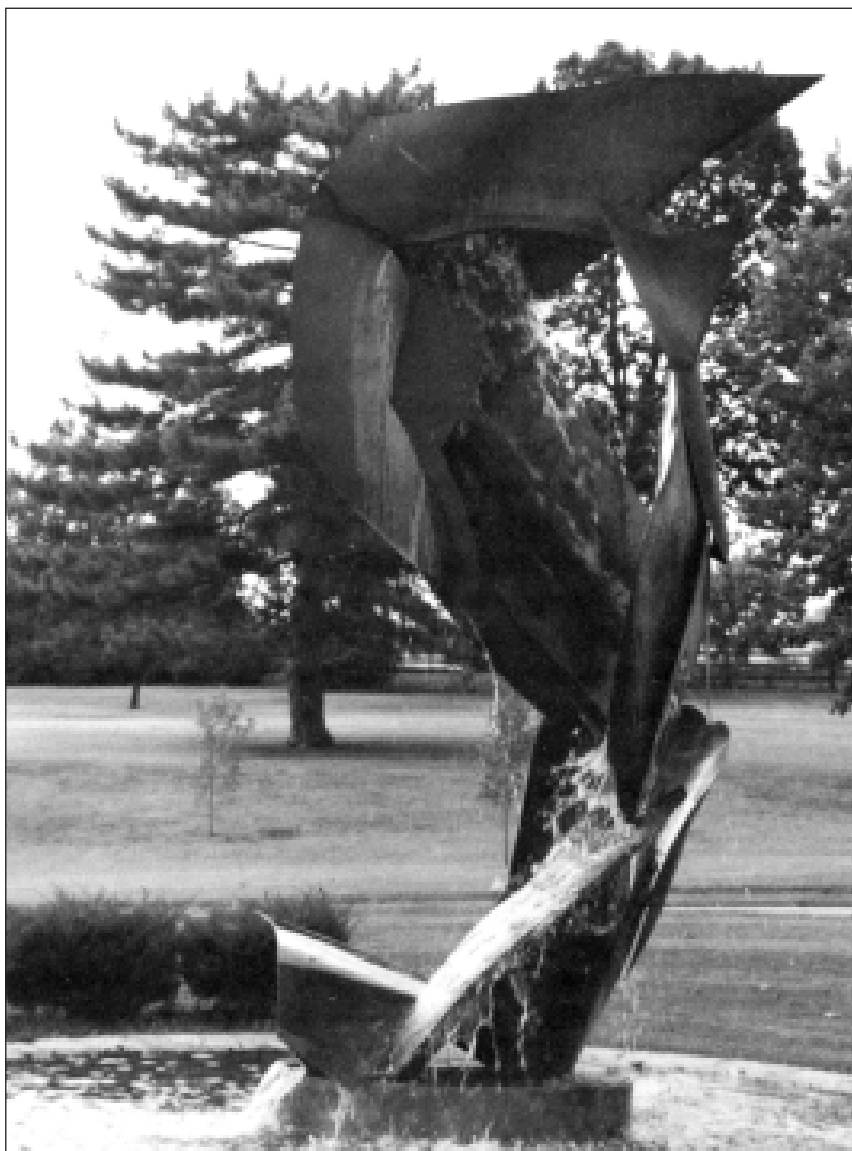
The Mercy of God flows through His Church to His people.