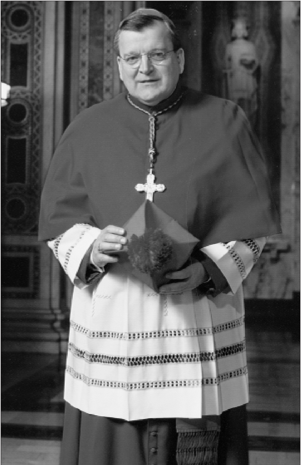
Archbishop Raymond L. Burke