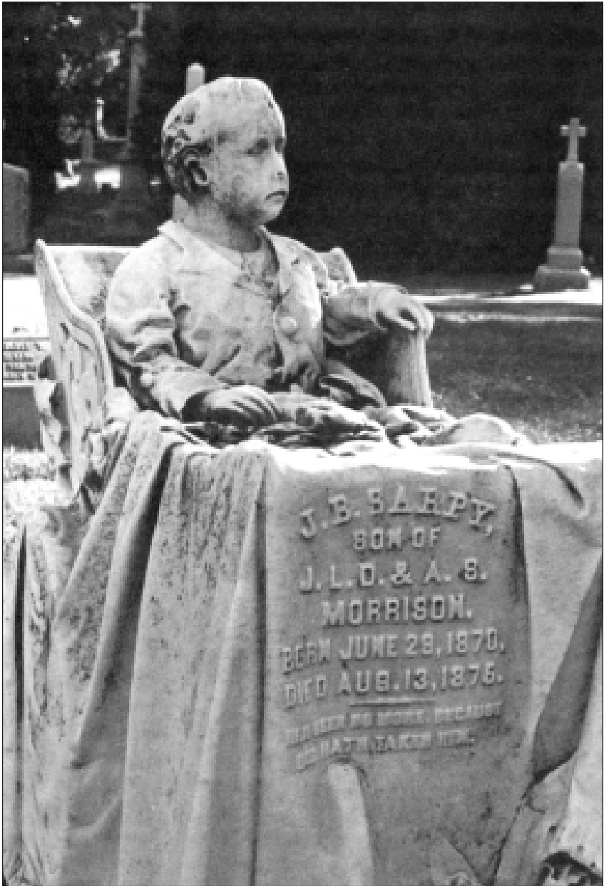
Sarpy/Morrison Monument in Calvary Cemetery